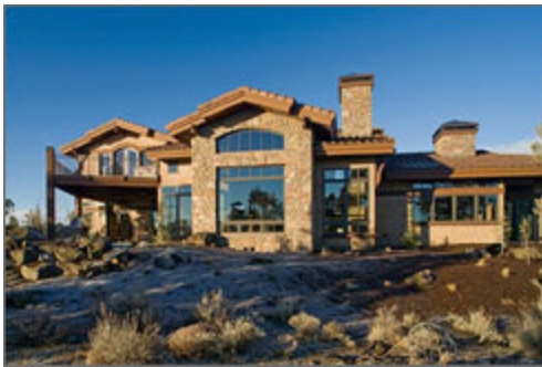
Enlarge

This house is on the fifth hole of the Nicklaus golf course in Pronghorn.